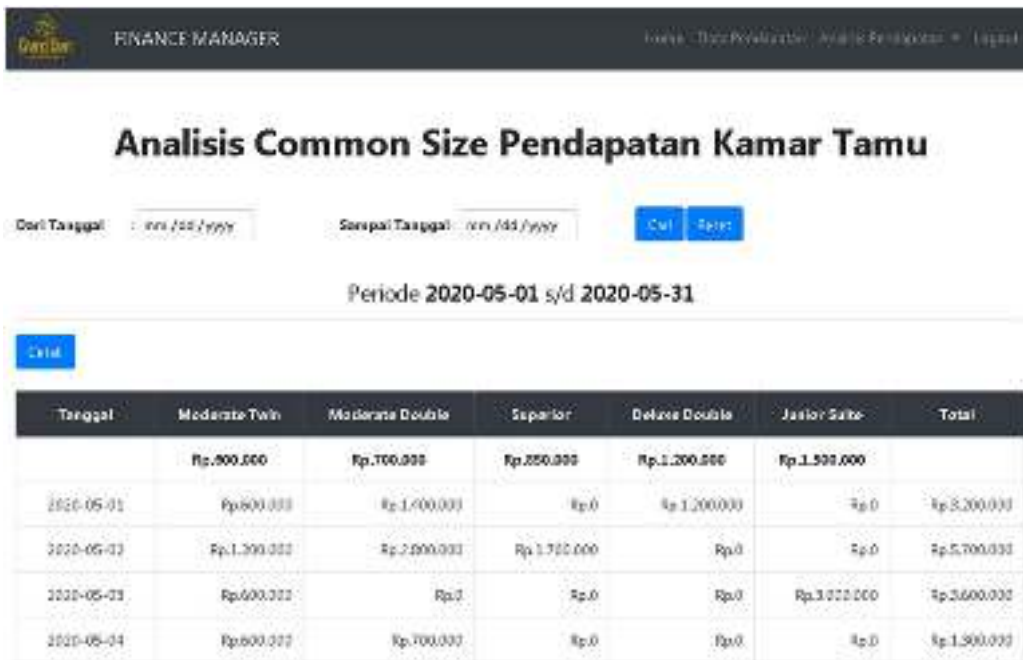
Figure 5. Income Common Size Analysis Menu

The revenue common size analysis menu in Figure 5. is used to display room income analysis data in the form of a percentage using the common size method with a period of one month. This menu consists of search button, reset button, print button, date, room type, total, grand total and common size percentage.