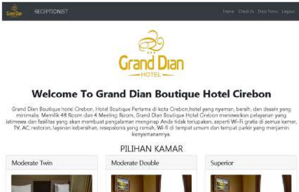
Figure 3. Main Menu Receptionist