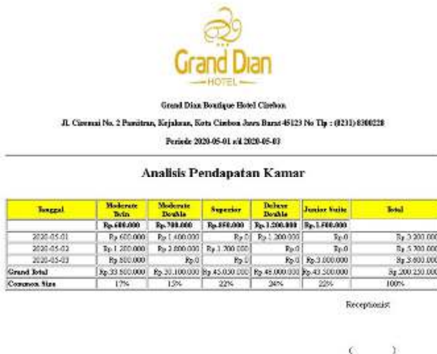
Figure 6. Print Menu Common Size Analysis of Room Rental Income