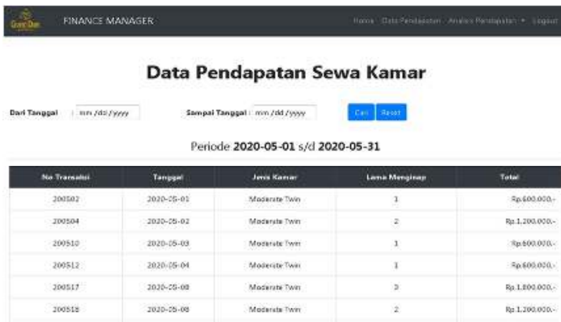
Figure 4. Payment Data Menu

The Payment Data menu in Figure 4. is used to display room rental payment data at Grand Dian Boutique Hotel Cirebon which can be viewed per period each month. There is a search button, reset button, transaction no, date, room type, length of stay, total.